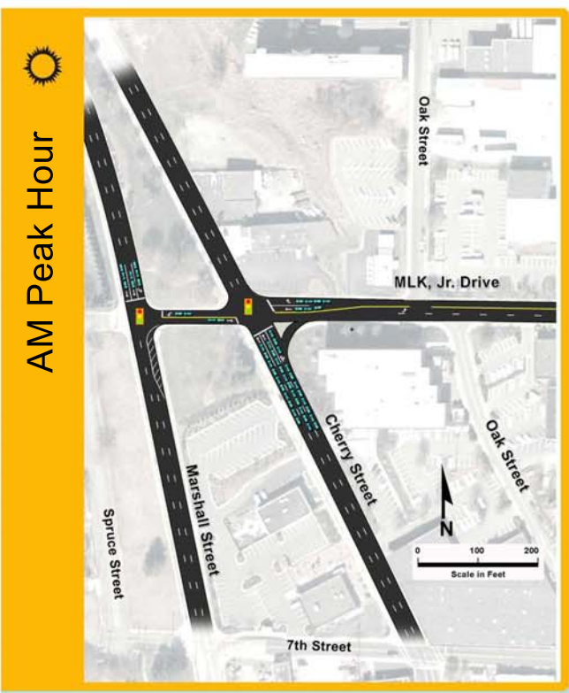
Existing Roadway Network